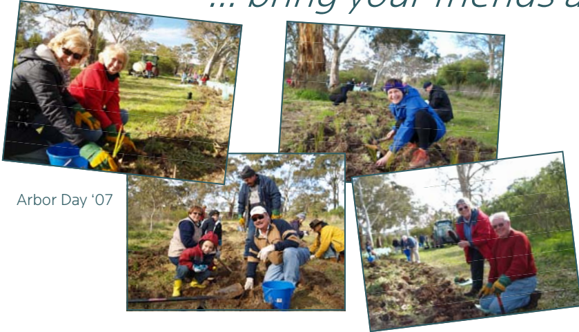
Arbor Day '07

... bring your friends and family for the day!