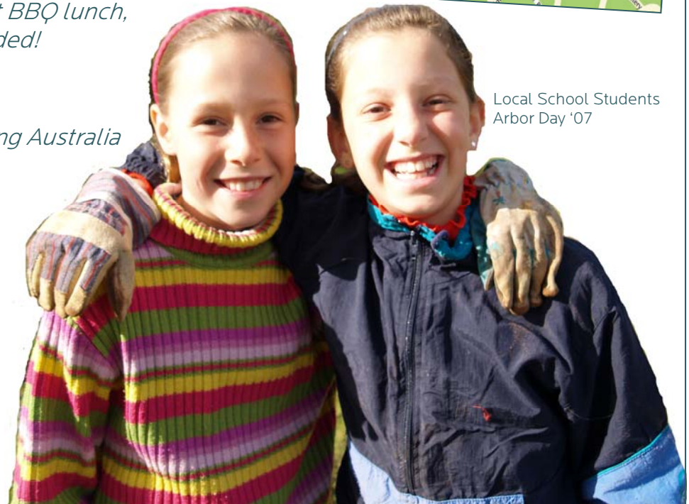
Local School Students Arbor Day '07